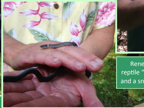
One attendee is brave!