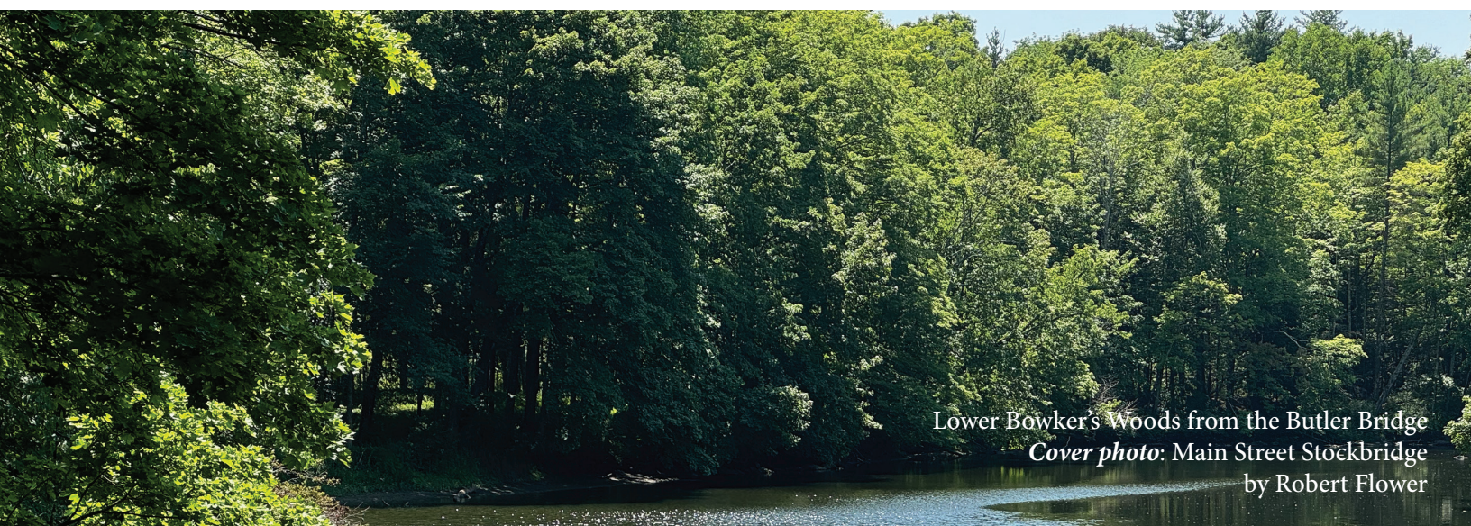
Lower Bowker's Woods from the Butler Bridge