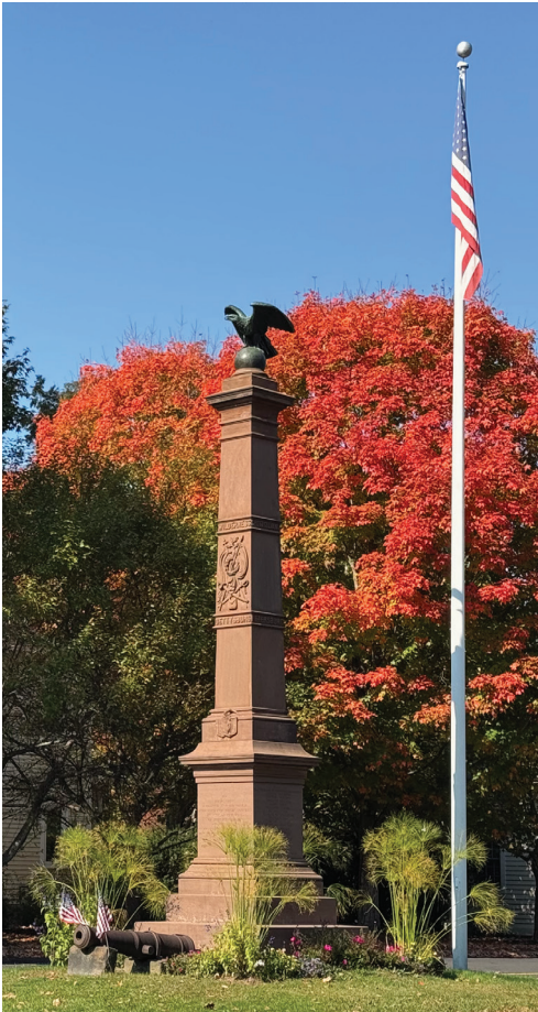
War Memorial Monument

we invite our neighbors to join us. Together, we can ensure that the legacy of civic pride that began on Laurel Hill continues to flourish for generations to come.