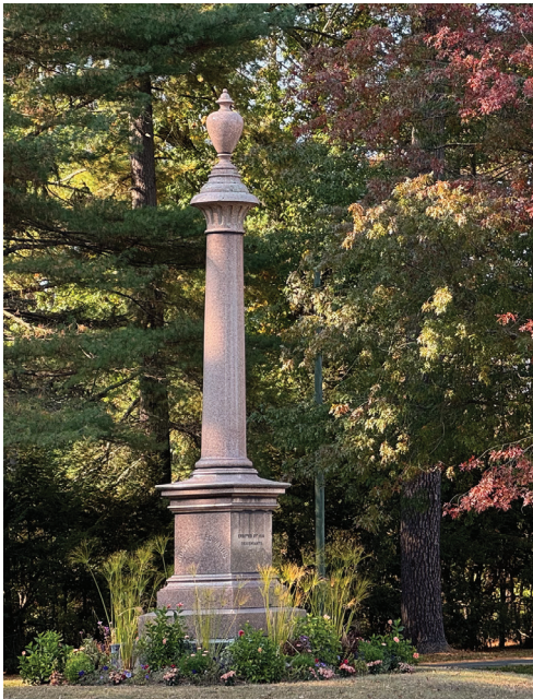
Jonathan Edwards Memorial

In the coming months, the Laurel Hill Association will engage with town committees and groups to explore new opportunities to strengthen our shared stewardship. Whether it’s improving public spaces, restoring trails, enhanced plantings, or supporting thoughtful community projects, our goal is to collaborate in ways that sustain Stockbridge’s timeless charm.