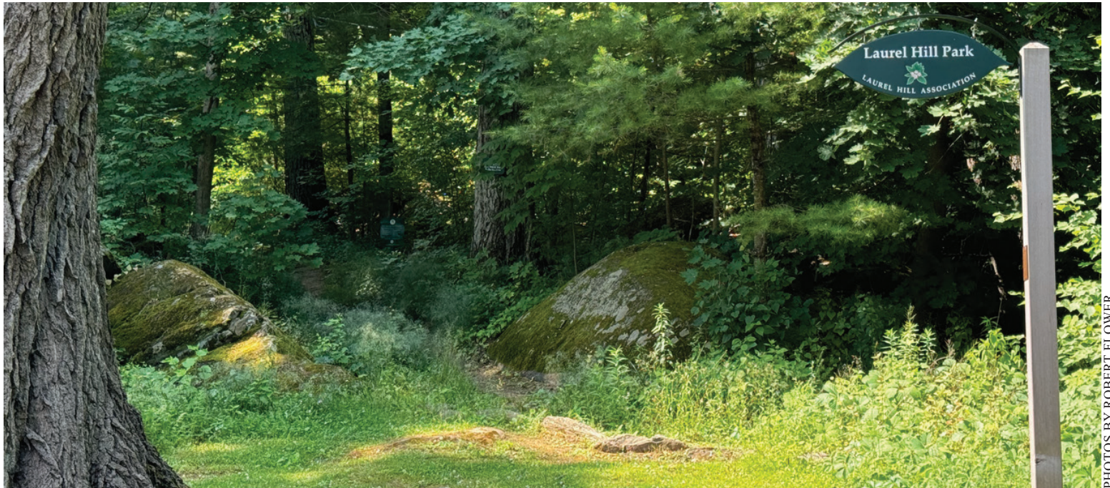
Entrance to Laurel Hill Park from the town offices

bers and an additional 150 trees by inspired Stockbridge villagers, working together we get so much more accomplished. It is, ultimately, the real nature of our Natures. 🌿