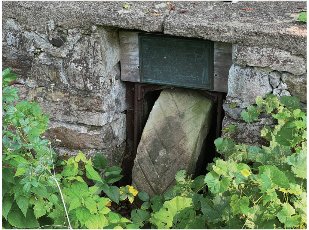
Pagenstecher Mill Wheel, Interlaken

LHA maintains 17 distinct natural areas across approximately 473 acres in and around Stockbridge. Just over 90% of these properties have been acquired through gift, will, trust, or transfer, starting, of course, with the gift of Laurel Hill Park by the heirs of Judge Theodore Sedgwick in 1878. There were only three, small acquisitions in the first forty years but each sits at the heart of Stockbridge history: Railroad Station Park (1.7 acres) in 1882; Goodrich Park (0.45 acres), which is the trailhead for three of our most popular trails and the site of the old Berkshire Street Railway trolley, in 1885; and Pagenstecher Mill Park (0.85 acres), the site of the first successful wood pulp mill in the U.S., in 1917. From 1917 until 2002 all acquisitions to LHA were a result of wills, gifts, or trusts. In 2002 we began our relationship with Stockbridge Land Trust and transfers of land or partnership. When you look at the acquisitions of land over our history, the names attached to these